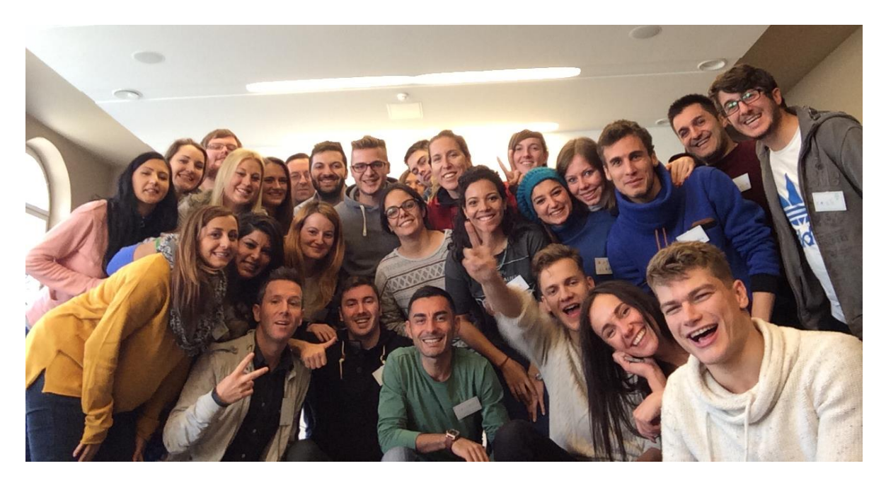
12: Training course's participants