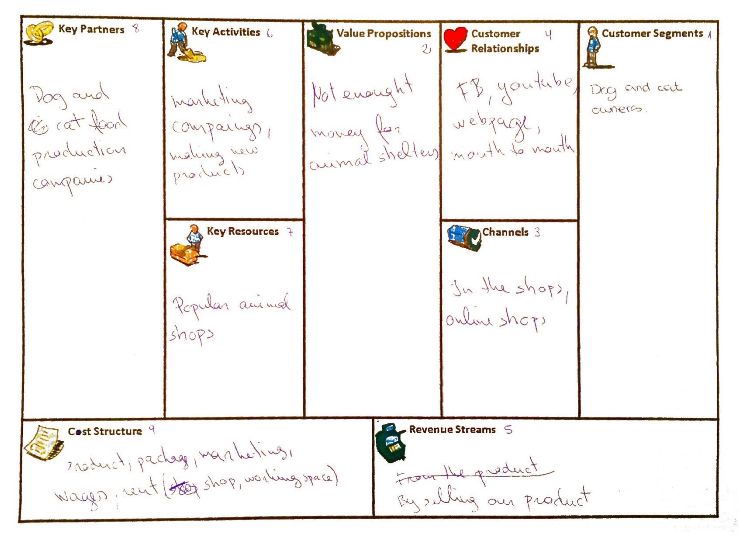
10: (filled-in) social business model canvas

"It was a fantastic experience and I would take it another 1000 times even with the same people! I will tell my friends that I have never had an experience like this! And thanks the organisers so much..."